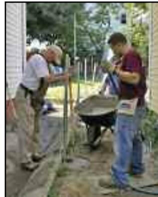
(RIGHT) 38-40 Veazie St. Posts are set in concrete for the chain link fence that was erected between the Habitat house and the house next door.