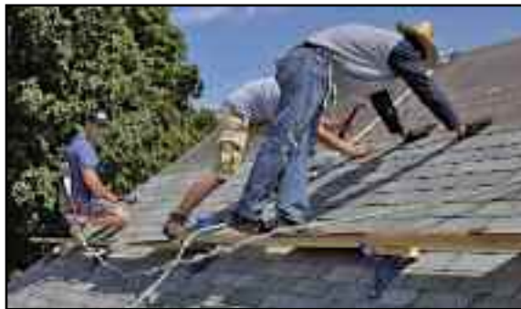
(ABOVE) 301 Swan St. Roof shingles are being applied to this single family house.