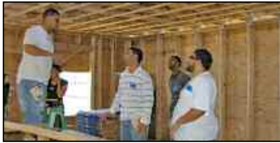
11 Trask St.: Interior walls are being constructed.

Update photos in this issue by Colleen Fox Choiniere