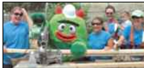
Brobee of Yo Gabba Gabba works on site with a miter saw with volunteers from Dermatology Professional Inc. on Trask St.

Today's hottest live show for families will be making a stop at the Providence Performing Arts Center (PPAC) on September 28th. Yo Gabba Gabba! Live! There's Party in my City! will be a great way to spend time with the family and to raise money to help build affordable housing in Providence.