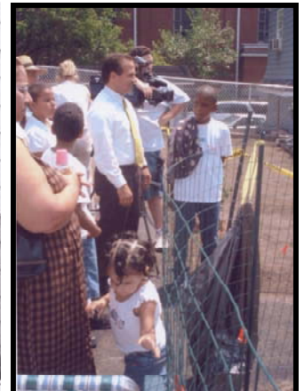
make dreams come true.